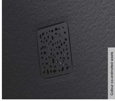
Colour co-ordinated waste