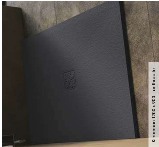
Kinemoon 1200 x 900 - anthracite