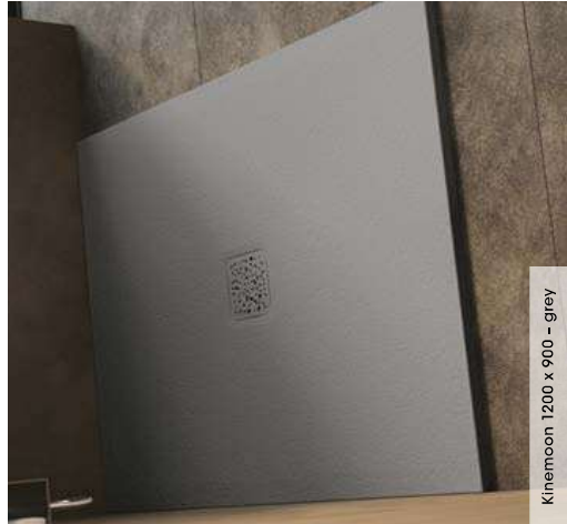
Kinemoon 1200 x 900 - grey