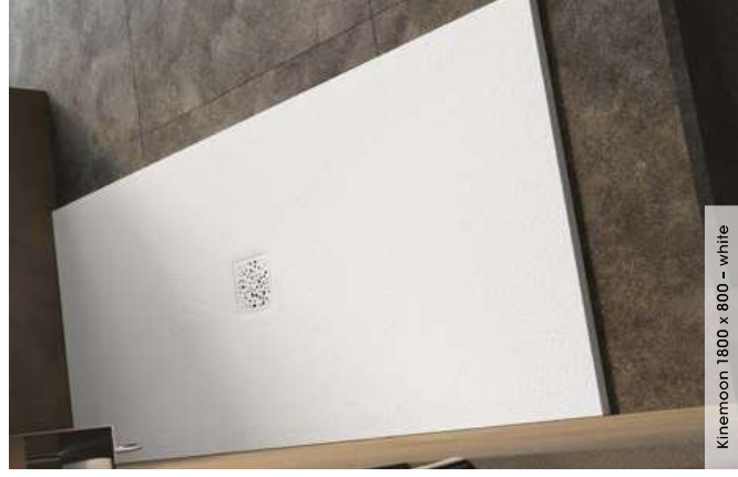
Kinemoon 1800 x 800 - white