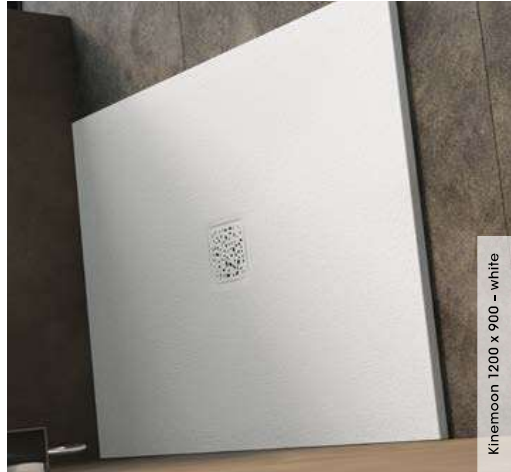
Kinemoon 1200 x 900 - white