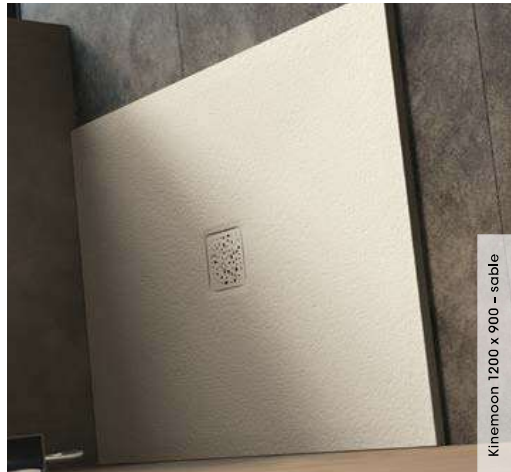
Kinemoon 1200 x 900 - sable